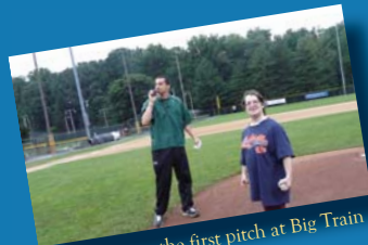
Throwing out the first pitch at Big Train Baseball.