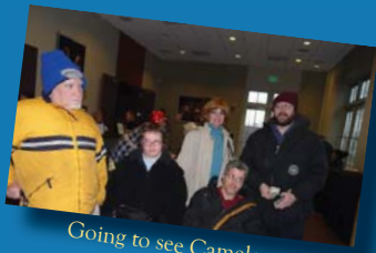
Going to see Camelot at the Olney Theater.