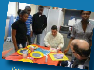
Painting with City Young Hero Participants